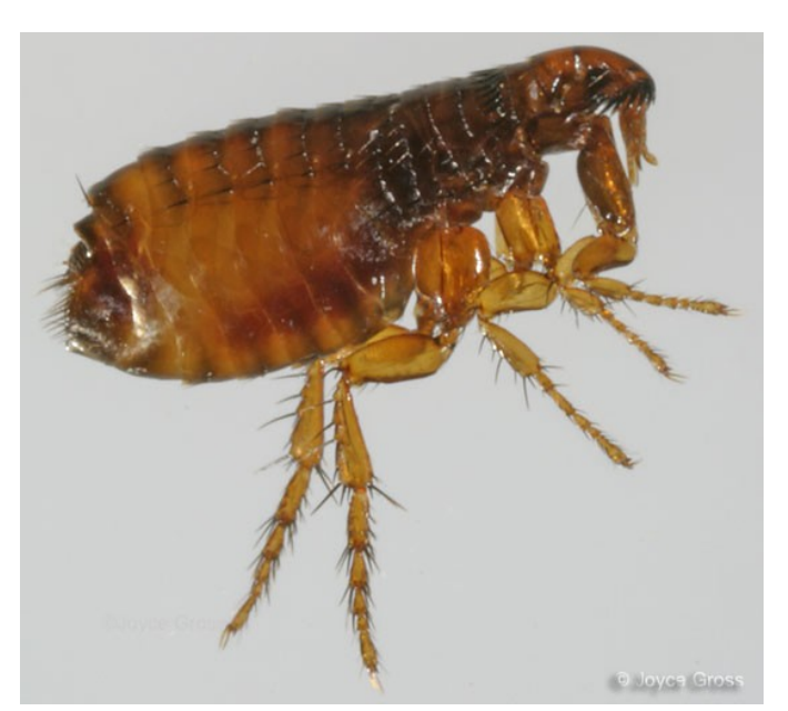
Cat flea; photo by Joyce Gross, calphotos.berkeley.edu.

Outdoor flea infestations can occur when wildlife, like rats, possums and raccoons frequent yards and have nests under or in building structures.