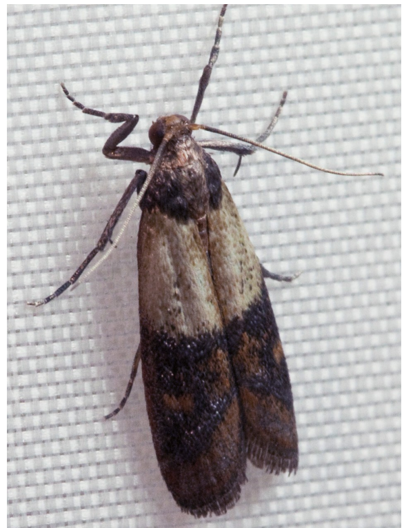
Indian meal moth; photo courtesy of Kaldari, Wikipedia.org.

Although most Americans find eating insects repulsive there is rarely any health or nutritional reason to avoid eating insects. Indian meal moth caterpillars are harmless to eat, and do nothing more than increase the protein content of the food.