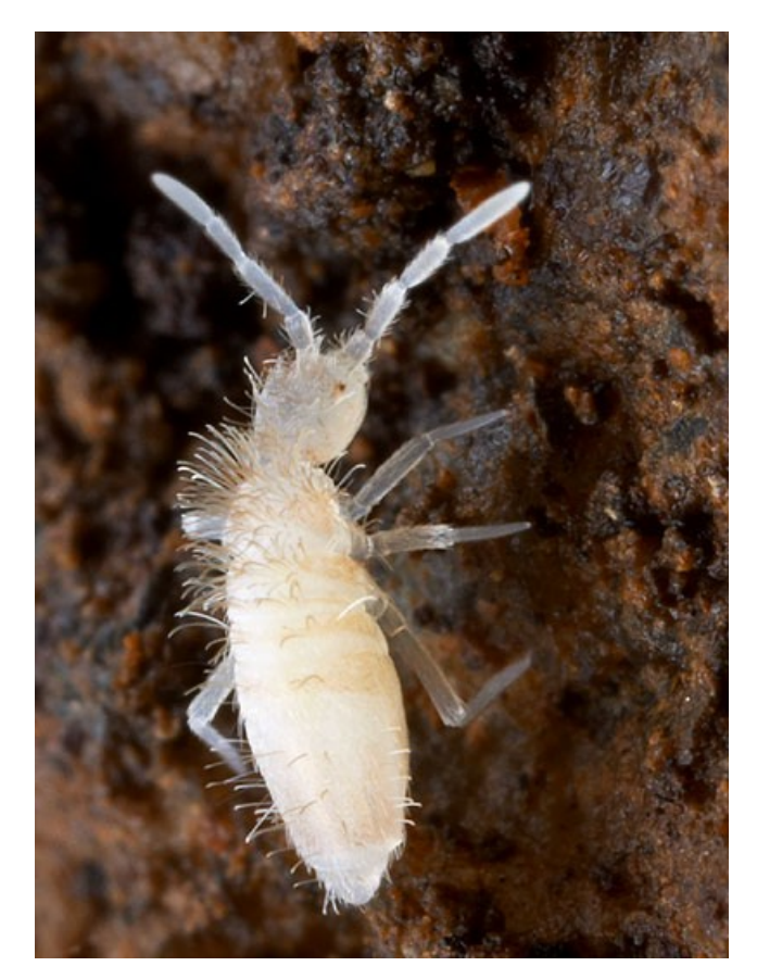
Entomybryid springtail.

One of the distinctive features of all springtails is their internalized mouths. Their actual mouth is retracted inside the head. They have to feed by sucking materials into the head. This means that they cannot chew or otherwise manipulate materials. It would be physically impossible for them to feed on or in the human skin.