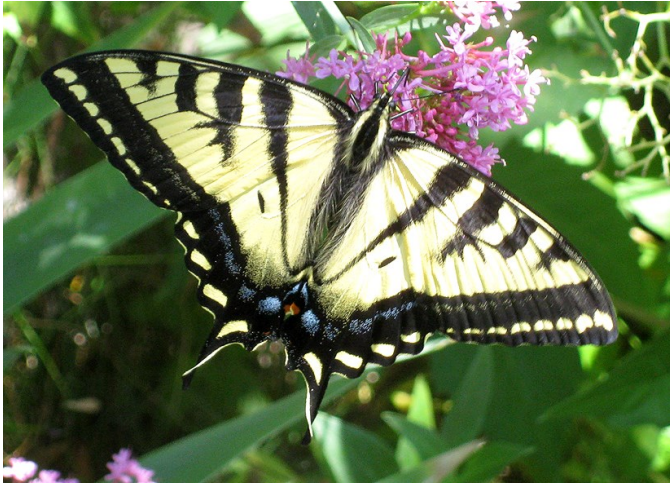
Western tiger swallowtail.

The western tiger swallowtail, Papilio rutulus is one of the more spectacular butterflies in California. Adults are brightly marked in yellow and black with a single "tail" on each hindwing. They also have a series of blue and orange spots on the hindwing. They have a wingspan of 3-4 inches.