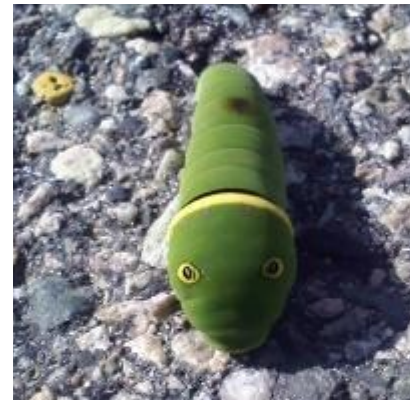
Mature western tiger swallowtail caterpillar.

The caterpillars can get quite large, reaching nearly 3 inches long just before they pupate. They feed on a variety of trees, including cottonwoods, sycamore, privet, willow, wild cherry, liquidamber, lilac and ash. The caterpillars change appearance as they grow and shed their skin. They molt five times before they pupate. Young caterpillars resemble bird droppings. As they grow they eventually become bright green