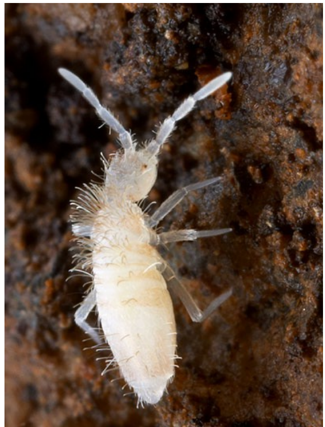
Entomybryid springtail.

One of the distinctive features of all springtails is their internalized mouths. Their actual mouth is retracted inside the head. They have to feed by sucking materials into the head. This means that they cannot chew or otherwise manipulate materials. It would be physically impossible for them to feed on or in the human skin.