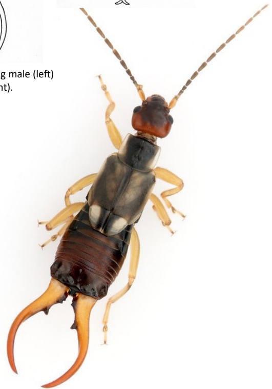
Forficula auricularia earwig.